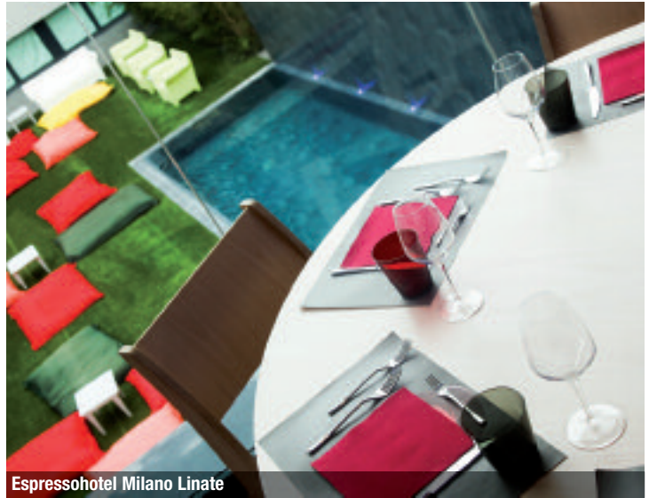
Espressohotel Milano Linate

In addition to the meeting rooms, Espressohotel Milano Linate offers alternative spaces that can be thoroughly reorganized and rearranged to meet different requirements: thus, the outdoor pool can be used