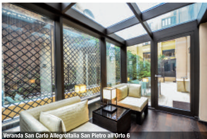
Veranda San Carlo AllegroItalia San Pietro all'Orto 6

È un'offerta tutta italiana quella del gruppo alberghiero AllegroItalia che, da cinque anni sul mercato e con otto strutture in Italia e in Cina, si distingue per creatività, massima flessibilità ed innovazione, con due brand: AllegroItalia Hotels & Resorts ed EspressoHotel. In particolare, nel capoluogo lombardo, il Gruppo vanta location straordinariamente appealing e unconventional per soggiorni ed eventi Mice. Vediamole.