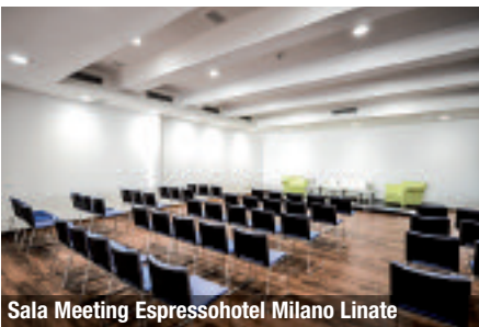
Sala Meeting EspressoHotel Milano Linate

A solo 600 metri dall'aeroporto, ex edificio industriale trasformato in spazio unconventional e innovativo, l'hotel offre 110 camere design, dotate di letti superking-size, televisore 40", doccia XXL e connessione wifi ultra-veloce. App dedicata per condividere con EspressoPad le attività e stringere nuove conoscenze. Piscina all'aperto, garage coperto, ristorante, business center con postazioni ad uso giornaliero. A completare l'offerta social di EspressoHotel Milano Linate la VIP Sauna aperta 24/7: Sauna, double jacuzzi, area relax e bar su prenotazione per eventi privati fino a 15 persone. www.allegroitalia.it ; www.espressohotel.it . P.T.