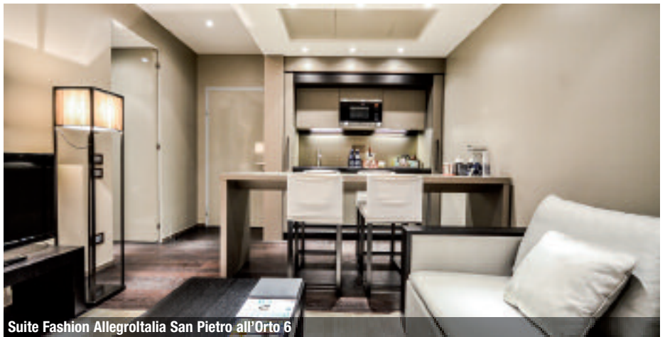
Suite Fashion AllegroItalia San Pietro all'Orto 6

In Milan the made in Italy Hotel Group offers glamorous and surprisingly dynamic locations