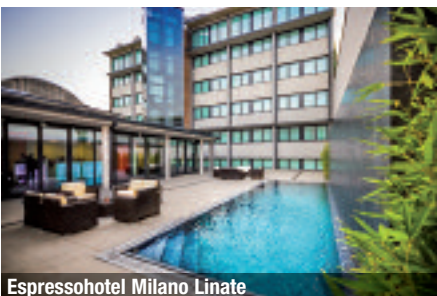
EspressoHotel Milano Linate