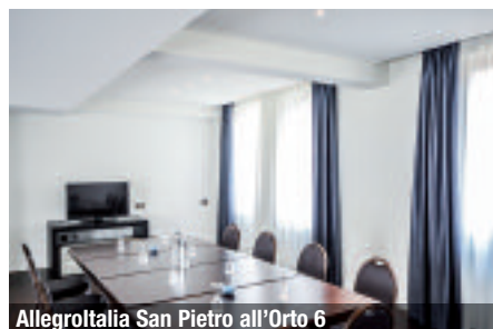
AllegroItalia San Pietro all'Orto 6

glam e alla moda coi comfort e i servizi esclusivi di un hotel 5 stelle anche per soggiorni brevi. Per gli eventi offre uno spazio meeting versatile e personalizzabile. La Maxi Penthouse, situata al quinto piano, si sviluppa su 140 mq con ampia terrazza panoramica nel cuore della zona più trendy di Milano, tra showroom di moda e di design, adattabile a qualunque tipo di riunione, evento o cocktail party, in grado di garantire massima privacy e di accogliere fino a 150 persone. Con il supporto del servizio catering selezionato da AllegroItalia è inoltre possibile scegliere e definire il menù più adatto all'evento e il miglior allestimento.