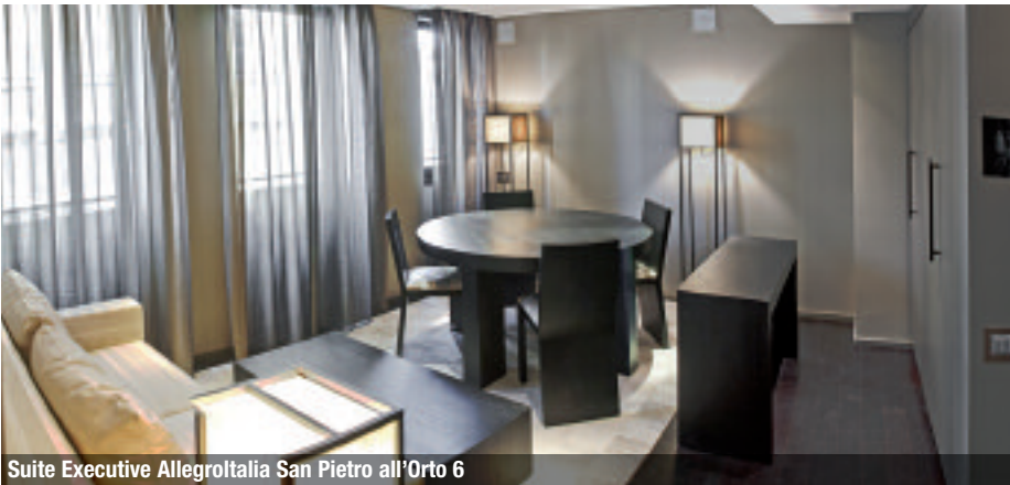
Suite Executive AllegroItalia San Pietro all'Orto 6