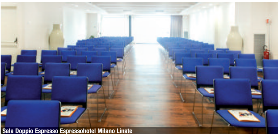
Sala Doppio Espresso Espressohotel Milano Linate

A VIP Sauna open 24/7 rounds out Espressohotel Milano Linate's social offer with its Sauna, double Jacuzzi, a lounge area and a bar that can be reserved for private events for up to 15 people. www.allegrolitalia.it ; www.espressohotel.it . P.T.