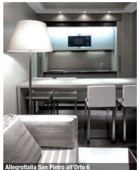
AllegroItalia San Pietro all'Orto 6